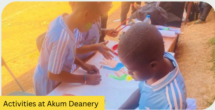
Activities at Akum Deanery