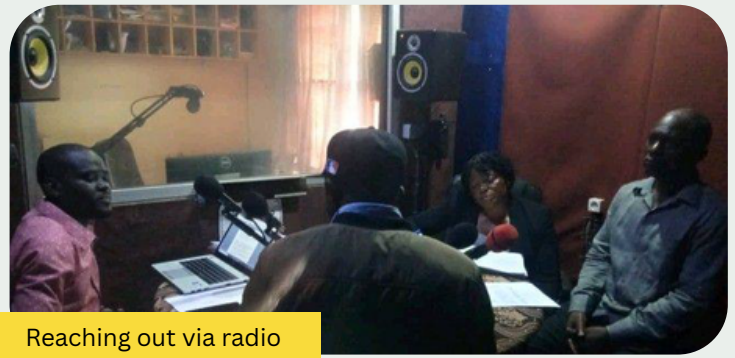
Reaching out via radio