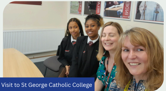
Visit to St George Catholic College

St. George Catholic College, Southampton was linked with St. Joseph's Mankon, Bamenda in 2024. St Joseph's is a new Secondary School that was created due to a need to educate the many young people who have been displaced by the recent civil conflict in Bamenda. St. George's College raised over £3,000 during their Romero day. In addition, as part of their Faith Day, to help student get to know more about the lives and faith of the students in Bamenda. The UK students wrote messages to their counterparts at St Joseph's.