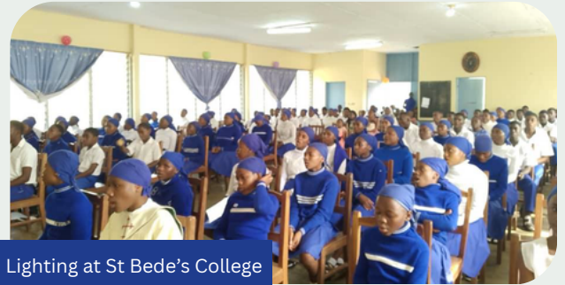
Lighting at St Bede's College

Three of our Diocesan secondary schools are twinned with Bamendan schools. Bishop Challoner Secondary School has had a long-held link with St. Bede's College in Ashing-Kom. This year the students raised over £6,000 to fund the purchase and installation of solar panels for a renewal, reliable energy source for the College which have now been installed and are providing a reliable and efficient source of electricity.